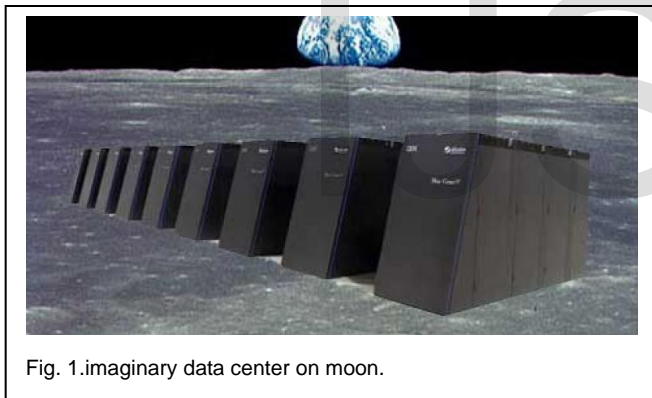
Fig. 1. imaginary data center on moon.

The working model of this data center is, the data will be sent through the radio signals and these radio signals will go to the ground station where the ground station makes this data into the radio signals to receive from the ground station