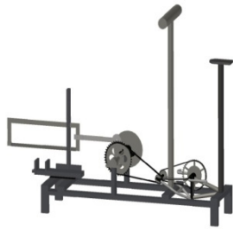
Fig.1 CAD aided design of Pedal Powered Hacksaw