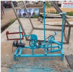
Fig.2 Pedal Powered Hacksaw