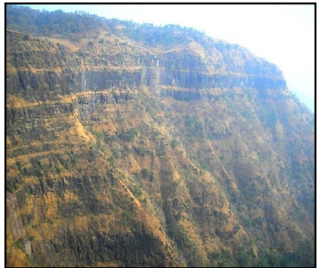
Fig.1 Thick horizontal flows of Basalt

Kulkarni P.S. (1985) demarcated various flows in different ghat sections of NE and central part of Maharashtra[2].