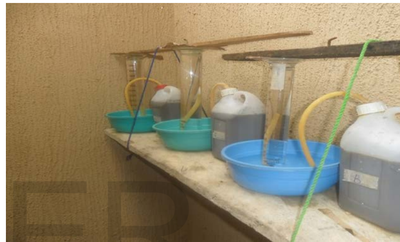
Plate 1.1 Biogas Setup