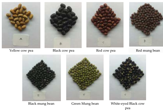
Fig 1. Seven varieties of bean grown naturally in Tanimbar Selatan for germination test

Petri plates-8 cm in diameter-were wrapped with used newspaper, sterilized at 180°C for three hours and kept one night in the oven at room temperature. A total of 10 mL of liquid inoculum (average density 10 7 cfu/mL) were poured evenly on the surface of filter paper on petri plate. Beans seeds were wrapped in wet cloth one night in the dark before 20 seeds were placed on filter paper. Control treatment received the same amount of sterilized water. All treatments were replicated two times. Covered Petri plate was placed in dark chamber for one day before transferred to the room chamber with natural light for two consecutive days.