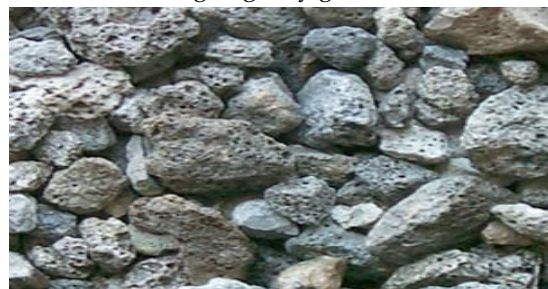
Fig No 1: Blast Furnance Slag